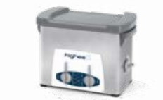
Highea 3 WASHING