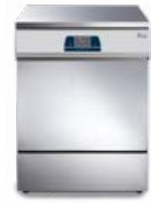
Tethys T60 - Tethys D60