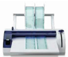
Millseal+Manual THERMAL SEALERS